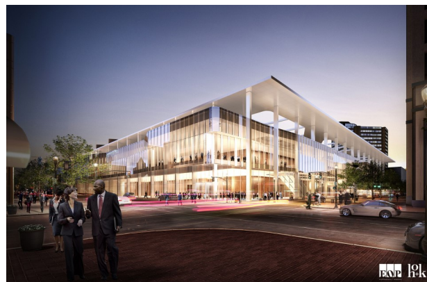
Kentucky International Convention Center