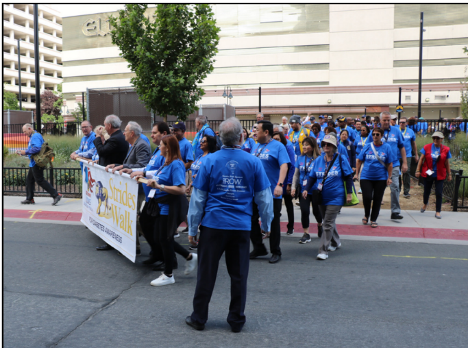
The Strides Walk kicks off at the Reno Forum in 2023.

More details about the Strides Walk will be provided in future issues of The Louisville Pacesetter.