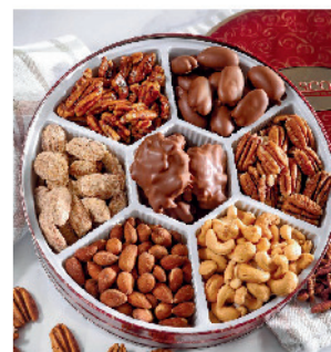
7 Way Tin